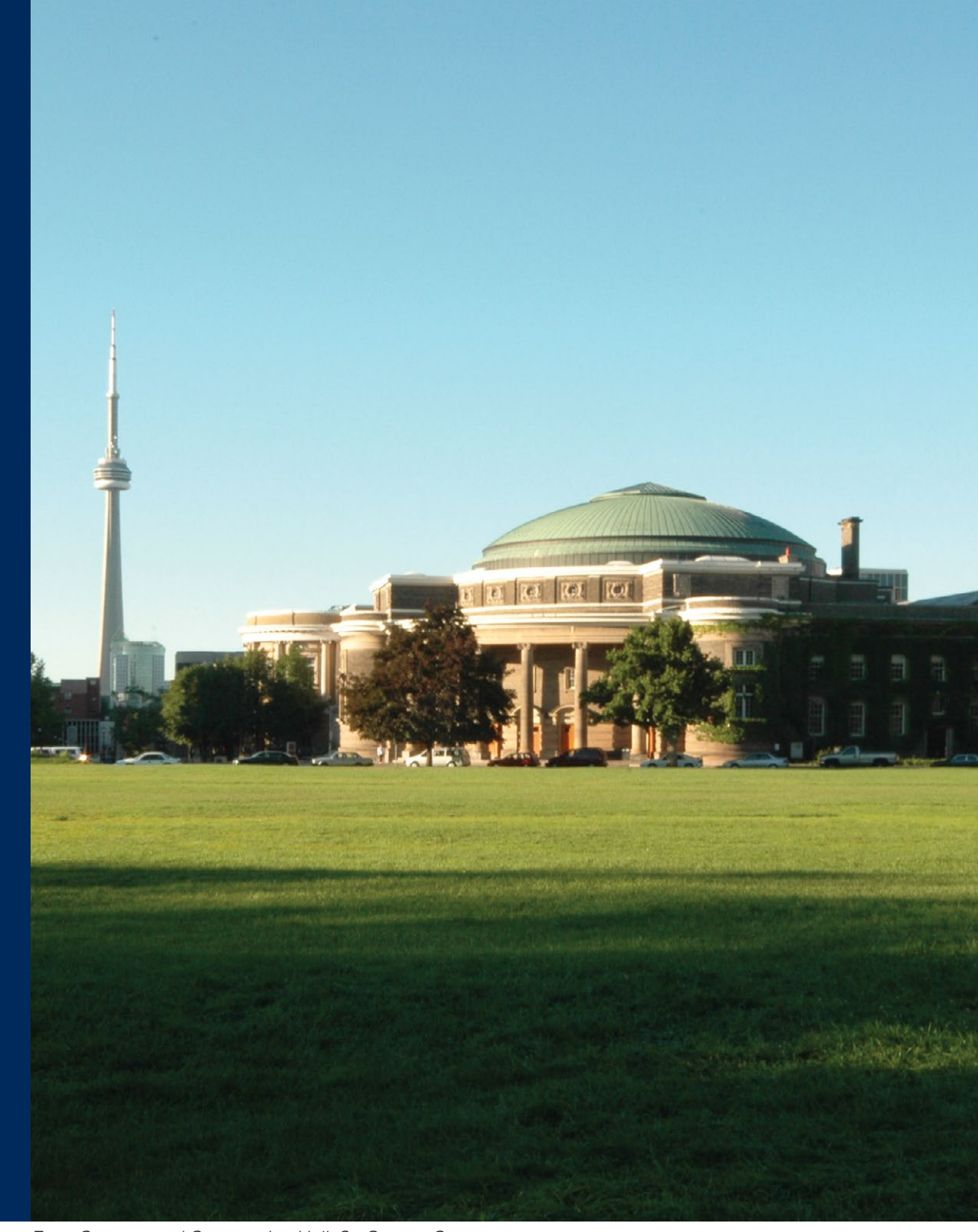
Front Campus and Convocation Hall, St. George Campus