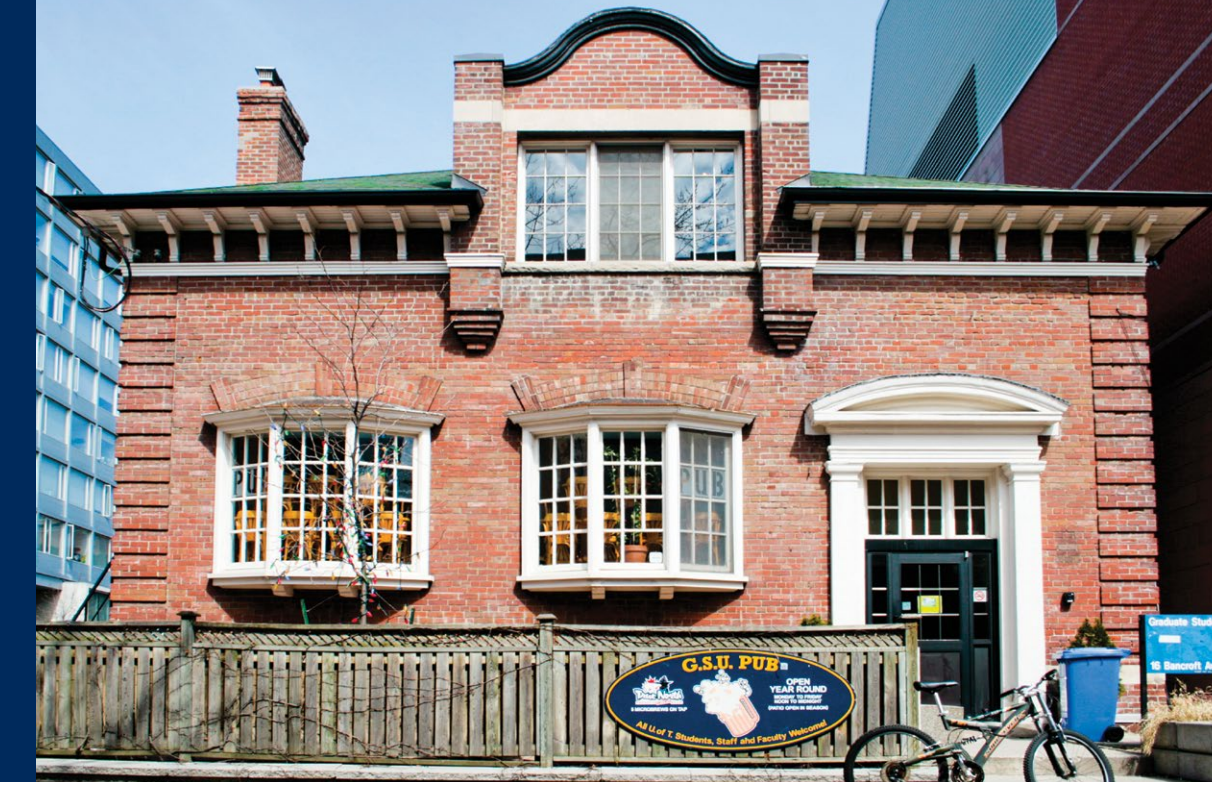
University of Toronto Graduate Students' Union, St. George Campus

In addition, the UTGSU is able to provide a variety of year-round services: