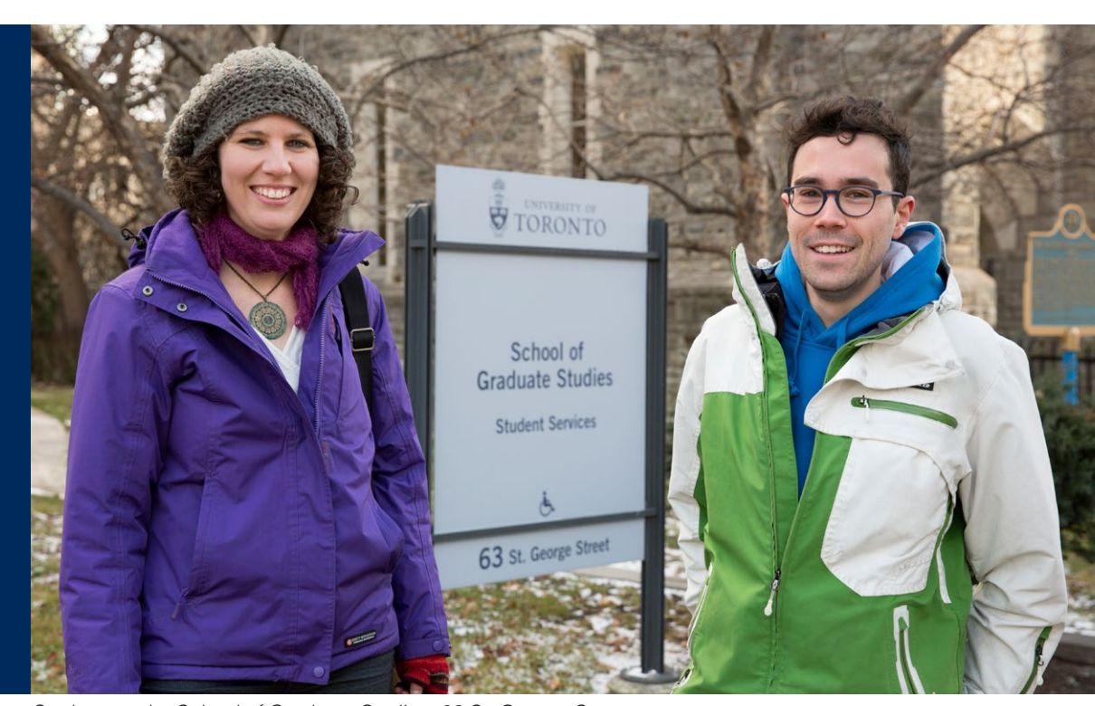
Students at the School of Graduate Studies, 63 St. George Street

All graduate students, both full-time and part-time, must pay a minimum degree fee by the time they complete their program. For master's students, this fee is based on the full-time program length for their program. If, at the end of your program, the total amount of academic fees you were charged during the time you were registered is less than this minimum degree fee, you will be required to pay the difference, known as the Balance of Degree fee. Note that there is no maximum degree fee. Acquaint yourself with your program's minimum degree fee as early as possible to avoid any surprises upon graduation, and ask the Student Academic Services office at SGS for more information.