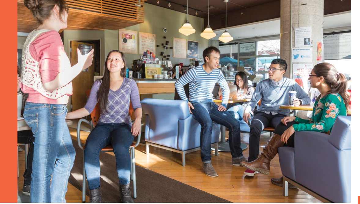
Students at the Grad Room, St. George Campus