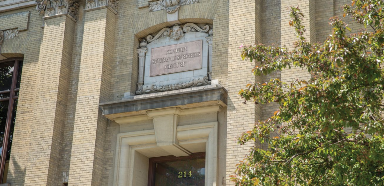
Koffler Student Services Centre, St. George Campus