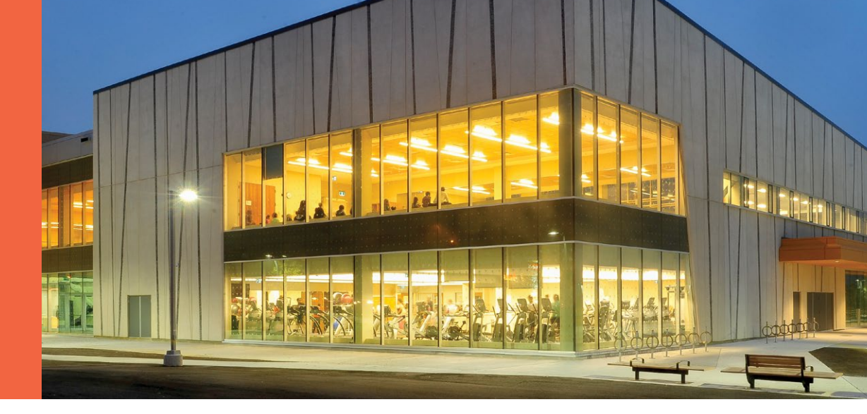
Toronto PanAm Sports Centre, University of Toronto Scarborough