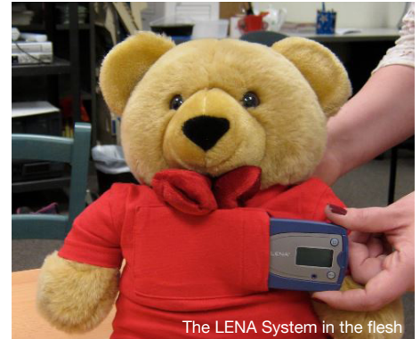
The LENA System in the flesh

Hillary: There's still a lot of research to be done to show the LENA System's reliability with non-English speaking populations. Right now, only English and Spanish are considered to be reliable. Using the LENA with these more non-English speaking populations will give us more information about what typical parent-child interactions look like for families who are not from western cultures.